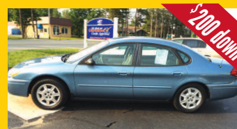
2005 FORD TAURUS Low mileage, seating for 6 PAYMENTS AS LOW AS $169/MO