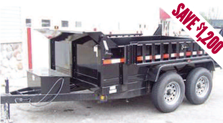
2014 Interstate 1 Griffin 6x10 dump trailer. Tandem Axle, Twin Cylinder, Monarch Pump, Powder Coated Paint, Interstate Battery, 5200 LB Axles, Heavy Duty Ramps, Load Tarp. MSRP $6,595