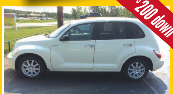
2006 PT CRUISER LIMITED Low miles and Moonroof PAYMENTS AS LOW AS $129/MO