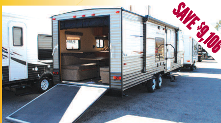
2015 Grey Wolf 26RR Toy Hauler Toy hauler travel trailer offers a rear ramp door for easy loading and unloading your favorite off road toys. In the cargo area you will also find two fold down sofas and a dinette table. MSRP $27,006.