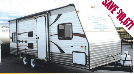
New 2014 Cherokee Grey Wolf 26BH Travel Trailer Bunkhouse, XL package, power tongue jack, power awning. MSRP $24,571.70.