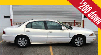
2004 BUICK LESABRE LIMITED Six passenger with great fuel economy PAYMENTS AS LOW AS $100/MO