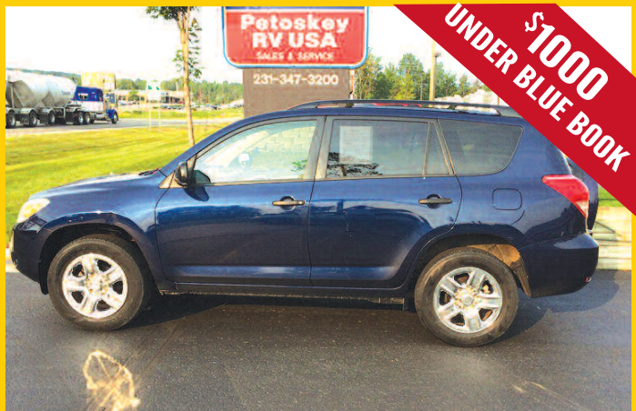
2006 TOYOTA RAV4 AWD GREAT NORTHERN MICHIGAN SUV! SALE PRICE $8,295