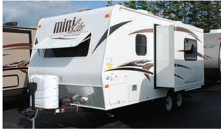
New 2015 Forest River RV Rockwood Mini Lite 2109S Travel trailer by Forest River

This travel trailer by Forest River offers a rear bath and a single slide. The sofa is on a slide. Double kitchen sink, three burner range, microwave, and extra counter space. You will also find a swing arm TV. MSRP $20,922.