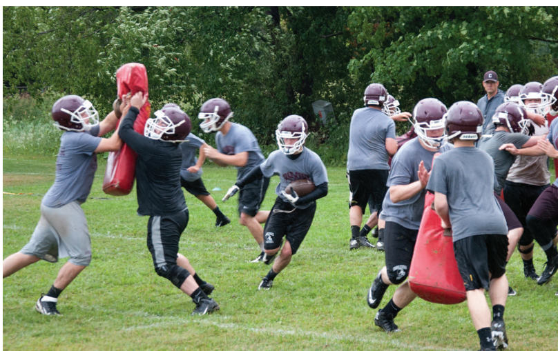
Charlevoix football players go through drills during the first week of practice.