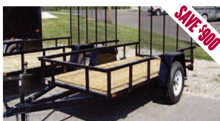
New 2014 Forest River 6x10 Open Angle Iron Trailer. Single axle, treated deck. MSRP $2,195