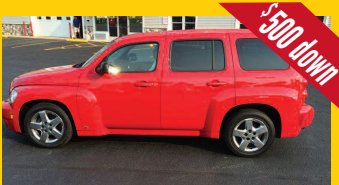
2009 CHEVROLET HHR Cool Economy Ride PAYMENTS AS LOW AS $149/MO