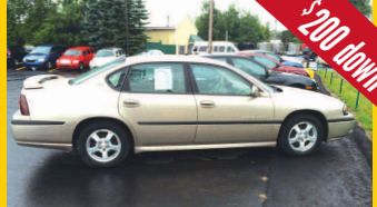
2003 CHEVROLET IMPALA Only 91000 miles, leather seats PAYMENTS AS LOW AS $189/MO

Ask about our Guaranteed Credit Approval