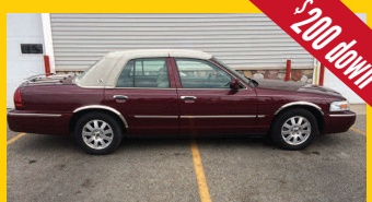
2006 MERCURY GRAND MARQUIS Leather Seating, Luxury Ride PAYMENTS AS LOW AS $159/MO