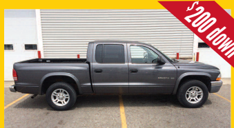
2002 DODGE DAKOTA 4 DOOR Great Condition Economy Truck AS LOW AS $179/MO