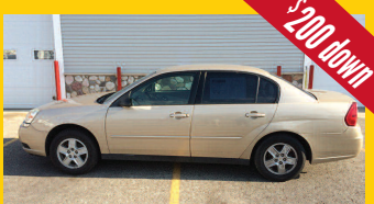
2005 CHEVROLET MALIBU Popular Family Sedan PAYMENTS AS LOW AS $169/MO