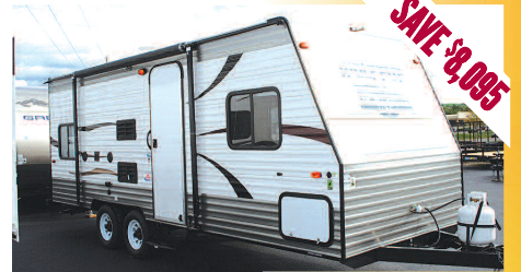
Used 2010 Palomino Sabre 31REDS Double Slide Fifth Wheel, Rear Living Area w/Ent. Center, 2 Swivel Rockers, Sofa & Booth Dinette Slideout, Pantry, 2nd Pantry, Front Queen Bed Slideout w/Nightstands & Much More. Regular Price $26,995.