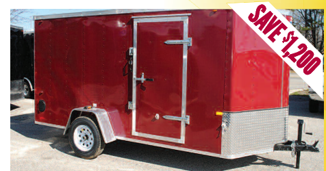
New 2014 Interstate 1 Wedge Nose 6x12 Cargo Trailers Rear Ramp Door, Front Diamond Plate, 14" Platform Height, Spring Axle & Much More Available in Red, Green or Silver. Regular Price $3,995. #SFC612SAFS