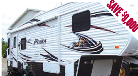
2015 Puma 253 FBS Fifth Wheel. Single Slide Puma Fifth Wheel w/Rear Living Area. MSRP $26,995.