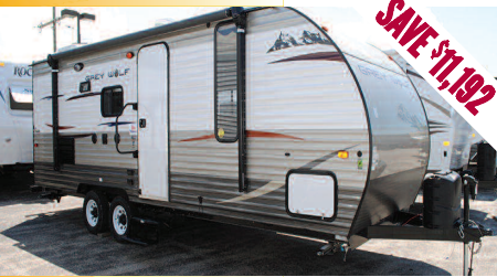
New 2015 Cherokee Grey Wolf 23BD Travel Trailer Power awning, slideout, tub/shower and more. MSRP $27,187.