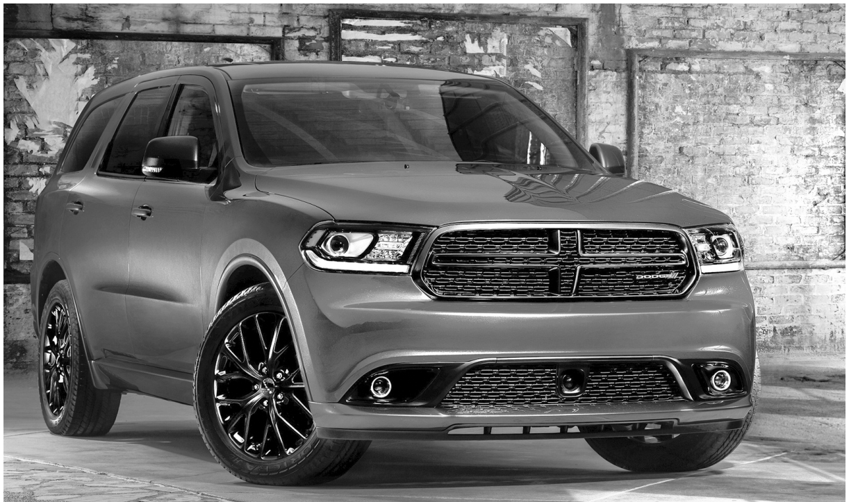
With the addition of Durango, the Dodge brand now offers the Blacktop Appearance Package on seven of its 2014 model year vehicles, including Charger, Challenger, Dart, Avenger, Journey and Grand Caravan.