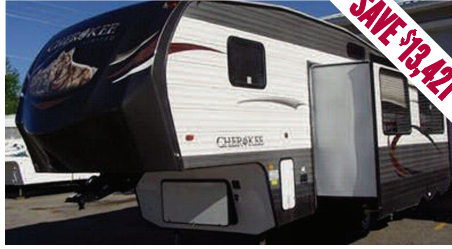
2014 Cherokee 235 B Fifth Wheel. The Cherokee 235B fifth wheel by Forest River offers a single slide and a rear set of bunk beds. MSRP $36,416.